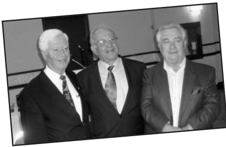
Photo Gallery Luciano Cavalin Roast, Turkey Roll and April Vision Meeting