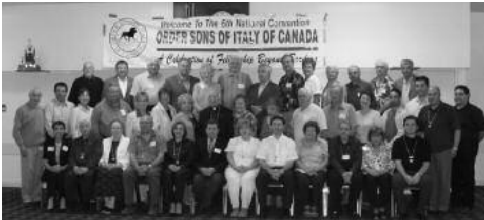
Past Grand Council Executive and 2005 delegates