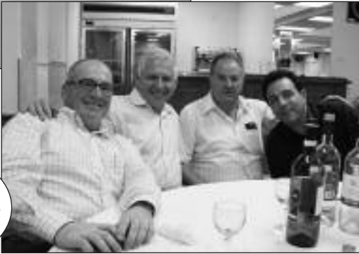
Liberty, Equality, Fraternity